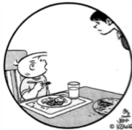
THE FAMILY CIRCUS By Bil and Jeff Keane

"If an apple a day keeps the doctor away, how many days do I get for an apple pie?"