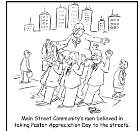
Main Street Community's men believed in taking Pastor Appreciation Day to the streets.

Pastor, we want to thank you for all your great advice, for all your beautiful sermons, and keeping Faith in our lives.