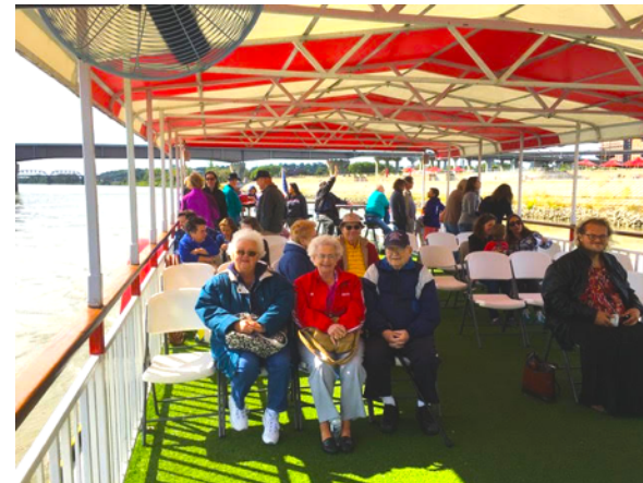
Worship on the River