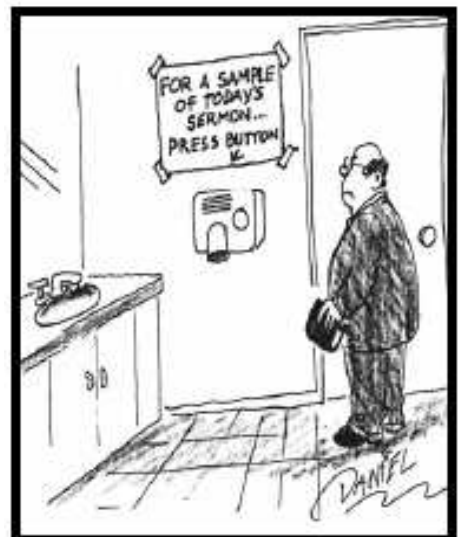
from JoyfulNoiseletter.com Reprinted with permission