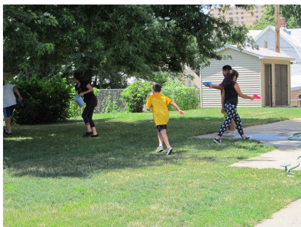
Kids At Work Youth playing on the last day in the annual water fight!