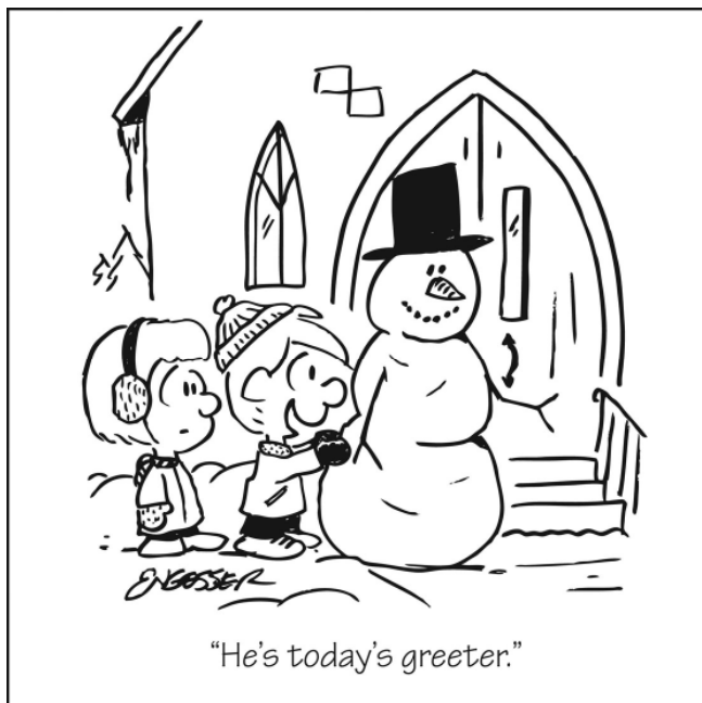
"He's today's greeter."