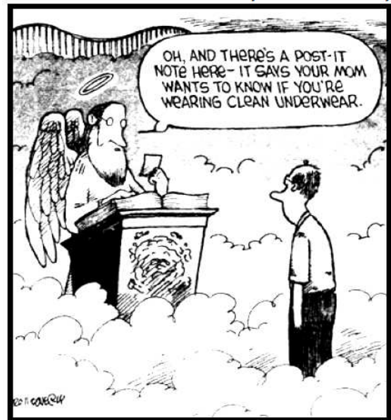
from JoyfulNoiseletter.com Reprinted with permission